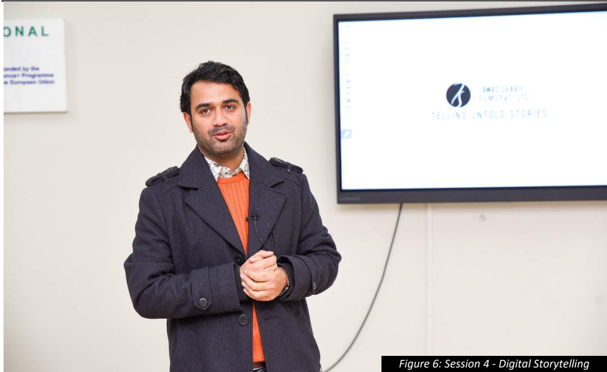
Figure 6: Session 4 - Digital Storytelling

Learning objective: Develop understanding of crafting innovative stories to engage audiences creatively and reporting impact.