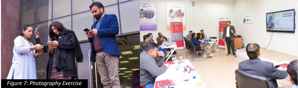
Figure 7: Photography Exercise

Learning objective: Equip participants with basic tips and tools for photography and create posts for social media.