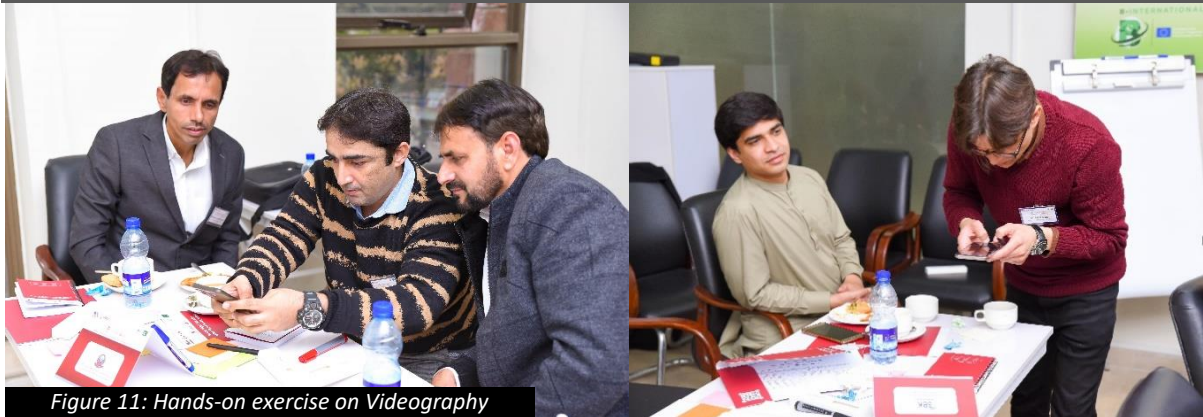
Figure 11: Hands-on exercise on Videography

Learning objective: Equip participants with basic tips and techniques for videography and create posts for social media.