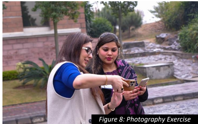
Figure 8: Photography Exercise

Exercise: One notable aspect of the session was the hands-on activity, where participants were encouraged to put their newfound knowledge into practice. They were tasked with venturing outdoors to capture photographs, applying the techniques learned during the session. This practical component provided participants with an opportunity to immediately apply what they had learned and gain valuable experience in real-world photography scenarios. Overall, Mr. Najam's session offered invaluable insights and practical skills that empowered participants to enhance their photography abilities using smartphone applications.