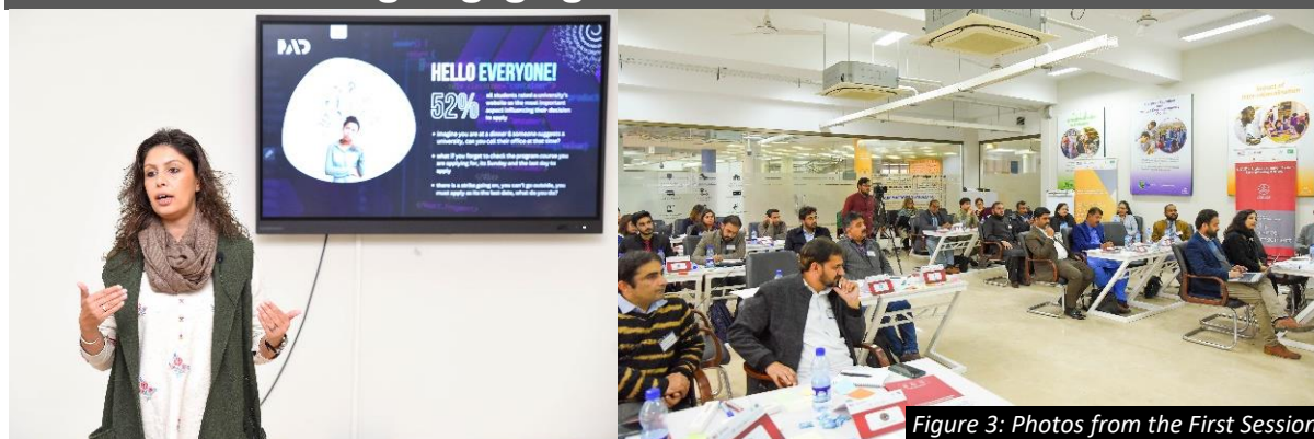
Figure 3: Photos from the First Session

Learning objective: Use websites as a marketing tool and agree on a standard template for building the project profile on official websites.